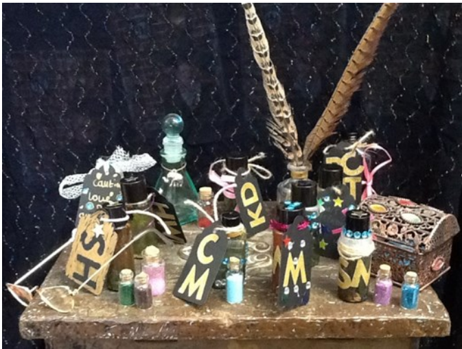
(Potions made from natural materials in Year 5 this week)

Thank you to everyone who came to Bingo yesterday. It is always a great event. I would like to say an extra thank you to the staff who organise the event and those who attend to make sure that it runs smoothly.