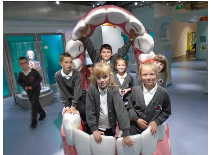
(Year 3 at Eureka last week)

A number of children have been attending school either in trainers or in sandal like shoes. Please remember that pupils' shoes should cover their feet entirely and that school shoes do form part of our uniform. We do not allow sandals or strappy shoes as they leave parts of the foot exposed which can mean that we get an increased number of injuries during break and lunch playtimes.